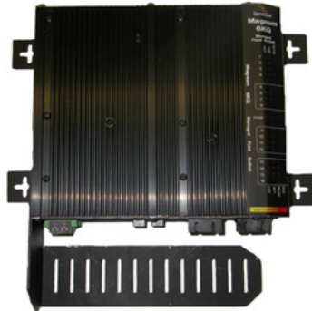
Tie-Wrap Bracket for cables (optional) Model # KQ-CABLE-BKT