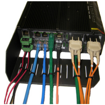
Bracket Model KQ-CABLE-BKT Shown with Cables

Gigabit SFP Small Form Factor Pluggable fiber optic transceiver for Slot D (configurable)